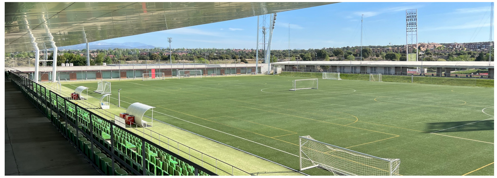
The Spanish National Training Centre & Accommodation in Madrid