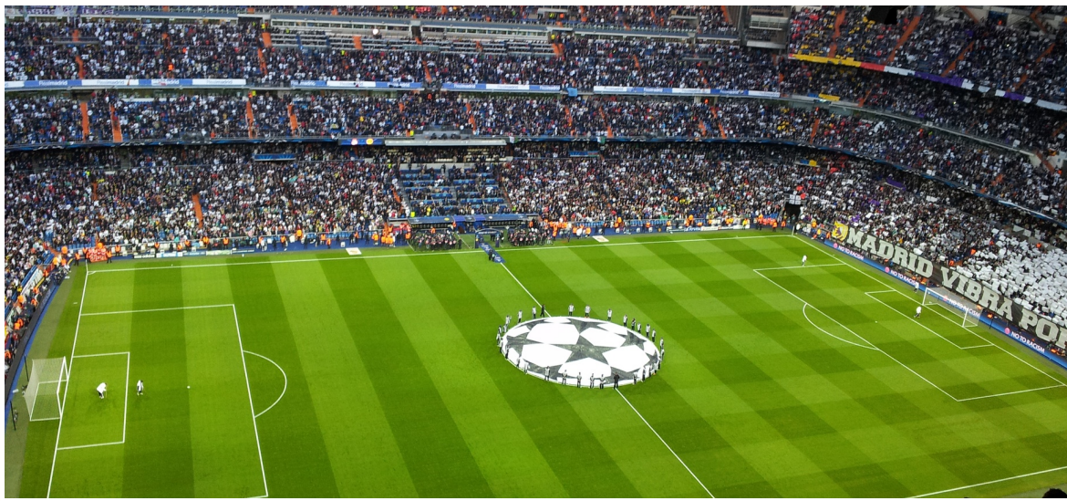
STADIUM TOUR LIVE LA LIGA MATCHES